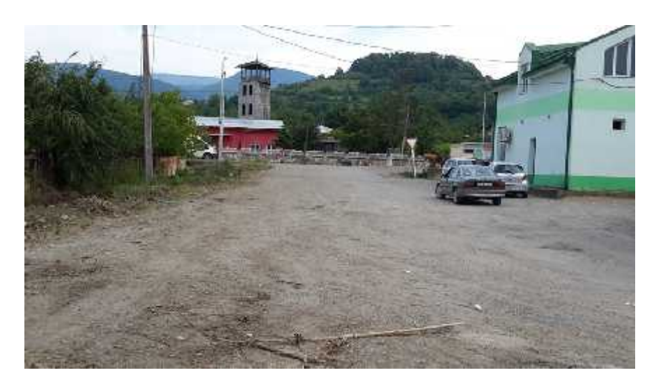
Chavchavadze and Kikvidze streets (K – 6)