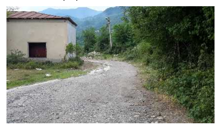
Culture house adjacent streets (K – 3)