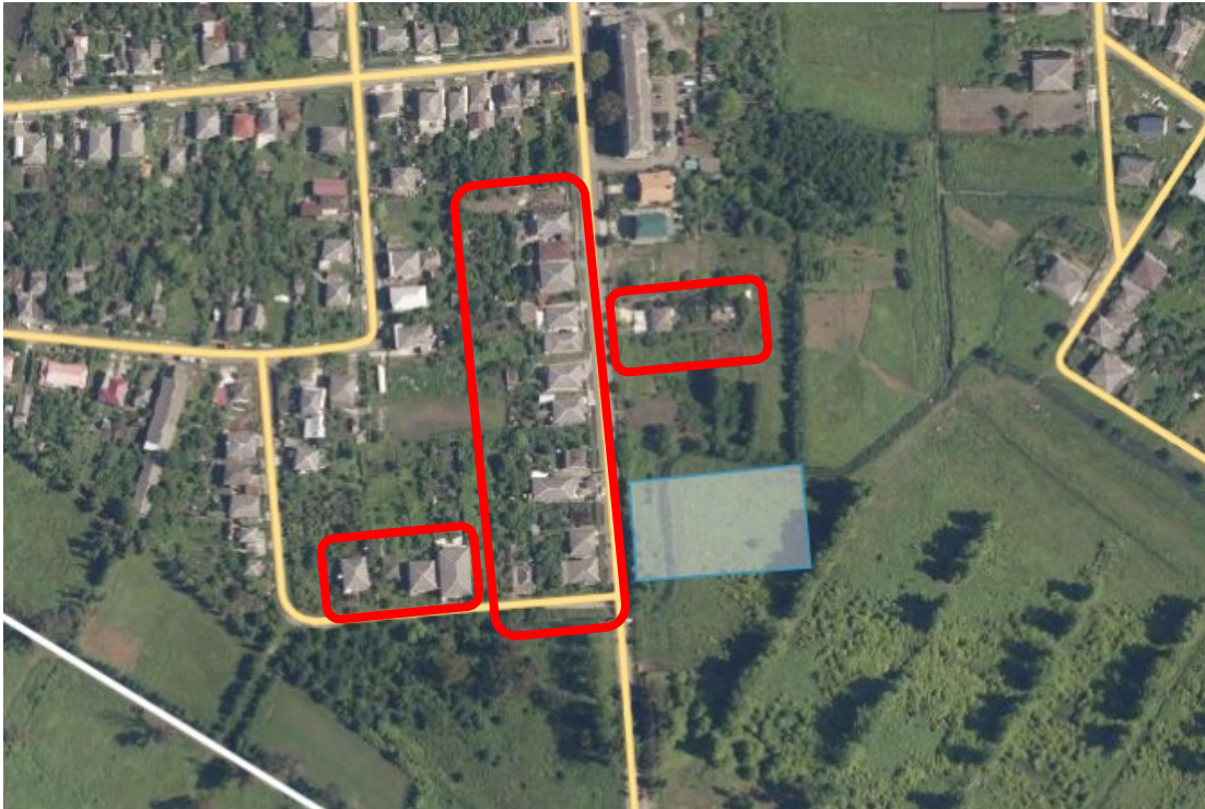
Figure 7 Sensitive receptors

154. A drainage canal crosses the edge of the plot selected for construction. It is planned to align the canal so that it no longer crosses the land plot.