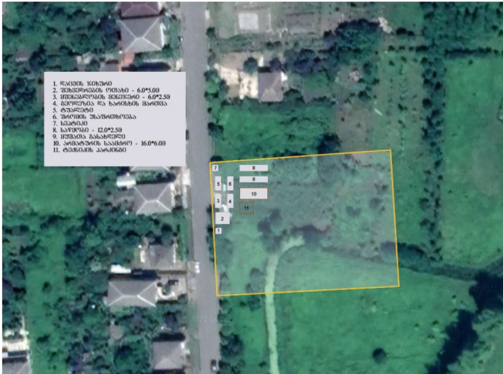
Figure 5 Construction site organization scheme

136. The Construction Company (CC) is encouraged to engage local labors to the extent possible.