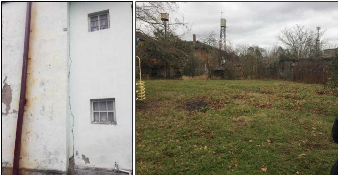
Figure 6. Photos of existing kindergarten

141. Currently there are 41465 inhabitants and 2041 pre-schoolers in city Poti. Therefore, there is increased demand on providing of this public service to local population. No action or a zero alternative implies refusal to the project implementation, therefore the problem related to providing enough places in the kindergartens for local population remain unresolved.