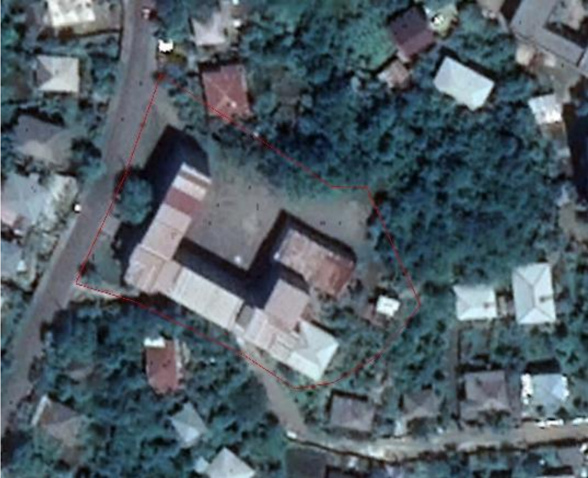
Attachment 1: Ortho Photo