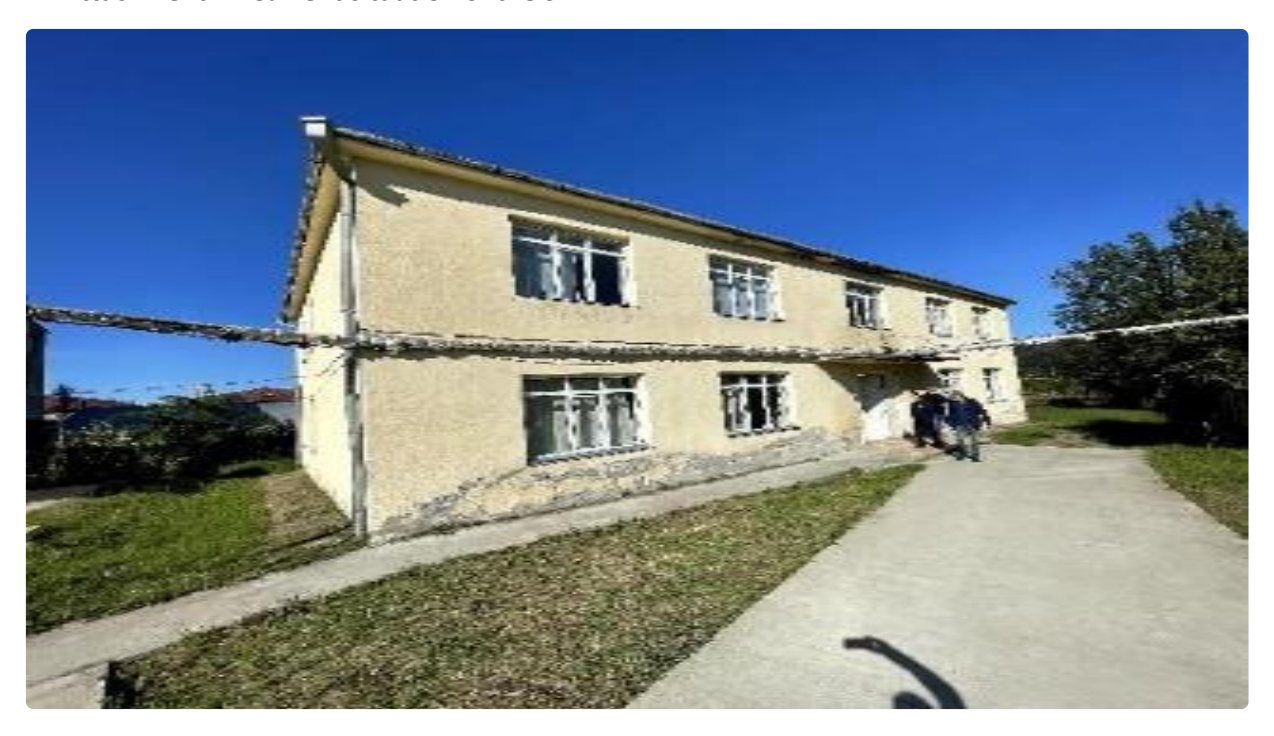
Attachment 4: Current situation of the SP