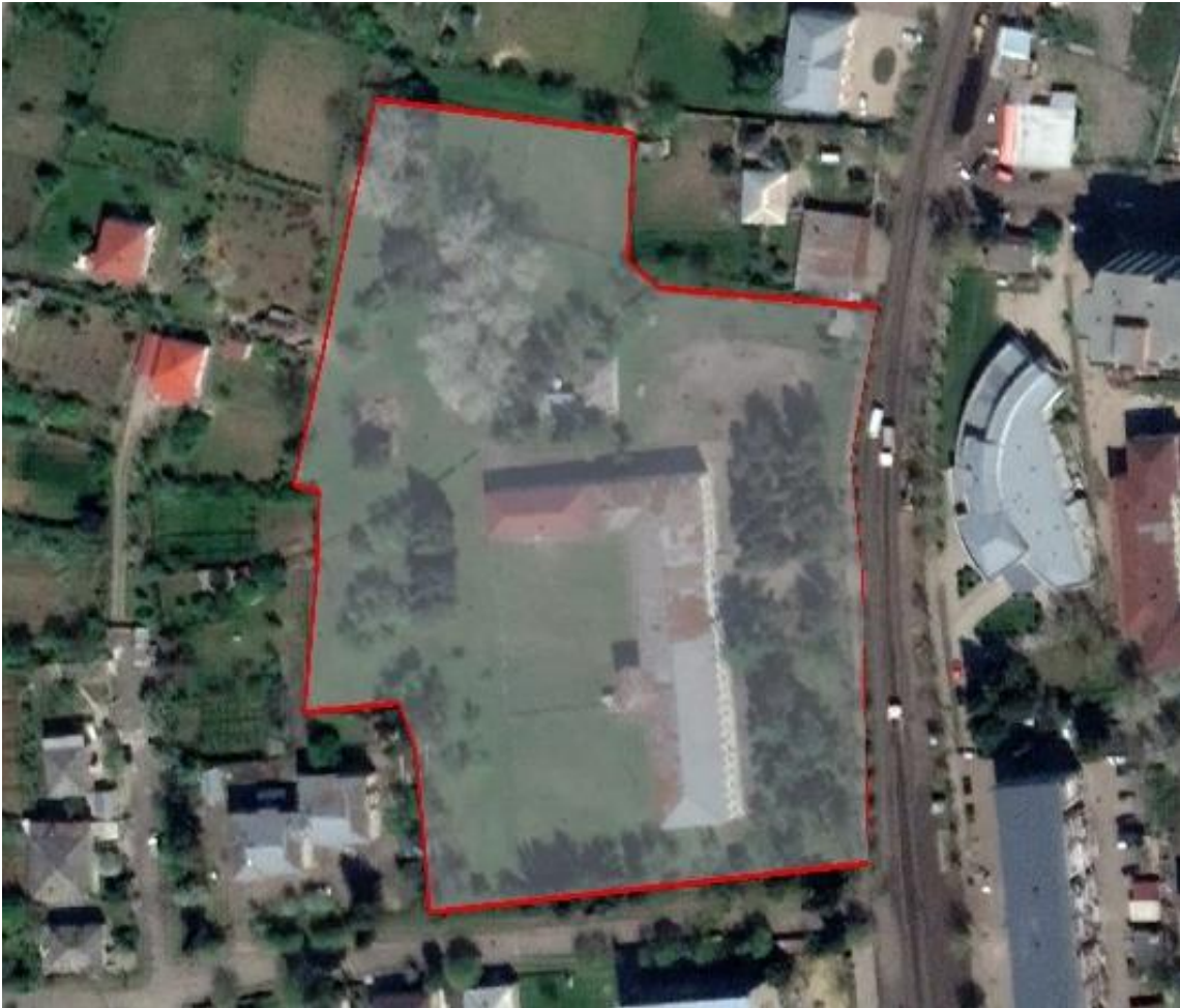
Attachment 1: Ortho Photo