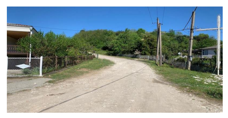
Attachment 1. The current condition of the Gamochinebuli-Zando connecting road