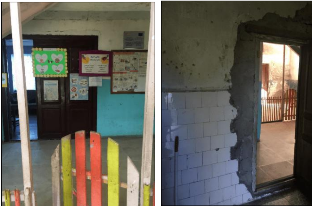
Figure 5. Photos of existing kindergarten

79. No action or a zero alternative implies refusal to the project implementation, therefore the problem related to providing kindergarten services for local population of village Didi Chkhoni will remain unresolved.