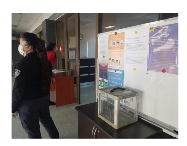
Figure 2 Banner, Zugdidi municipality