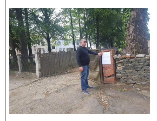
Figure 3 Banner, construction area