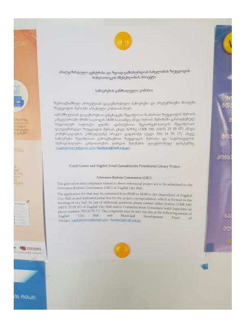
Figure 1 Banner, Zugdidi municipality