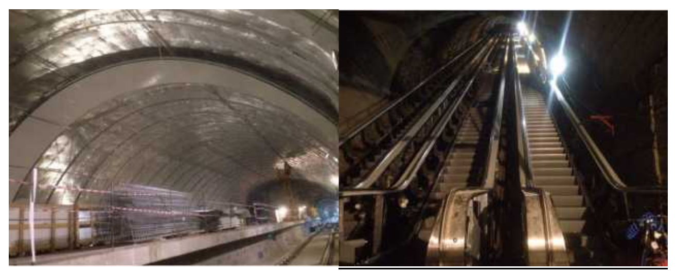
Installation of superstructure steel panel in platform