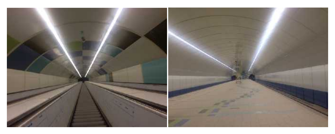
Escalator is installed